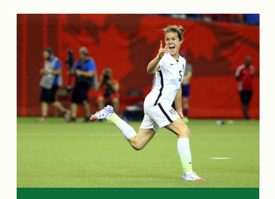
USWNT STAR KELLEY O'HARA TALKS ECON