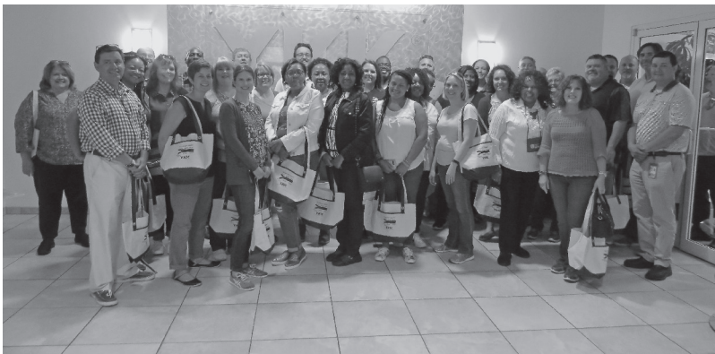
Georgia teachers from the 2017 tour