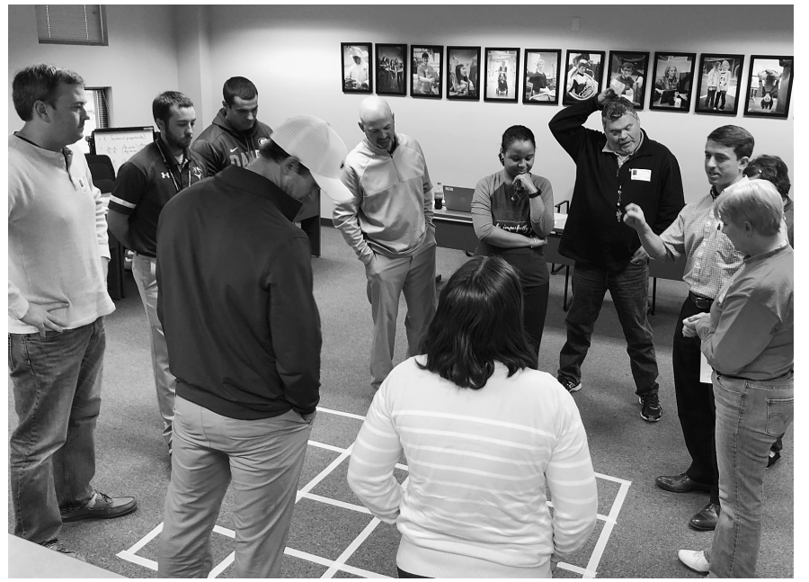
High school teachers learn about sustainability in a Georgia Council workshop

“When I went to the first workshop, it was a game changer,” he says. “They teach you everything you need to know about how to teach economics and make your students successful. Continuing to attend workshops makes me a better teacher every time I go.”