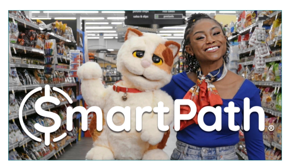
NEW TEACHER RESOURCE