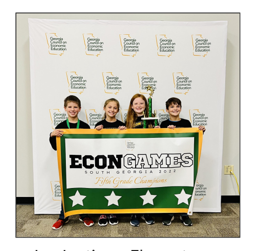
Len Lastinger Elementary

Copyright © 2023 Georgia Council on Economic Education, All rights reserved. GCEE Newsletter, January 2023