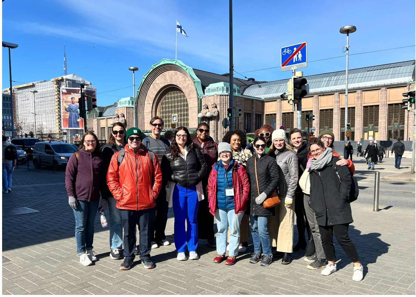
Study Tour participants outside Helsinki's Central Station